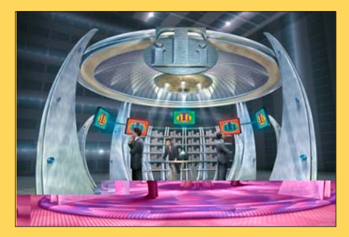
Tradeshows. With a multitude of exhibitors vying for the attention and time of tradeshow visitors, it can be difficult to stand out from the crowd. The LCD3000 helps your exhibit become the center of attention with its amazing screen performance. Its brightness and dynamic design will draw interest, while Rapid Response and a high contrast ratio allow you to effectively demonstrate your company's message. The lack of permanent phosphor image burn-in extends the monitor's life and protects your investment.